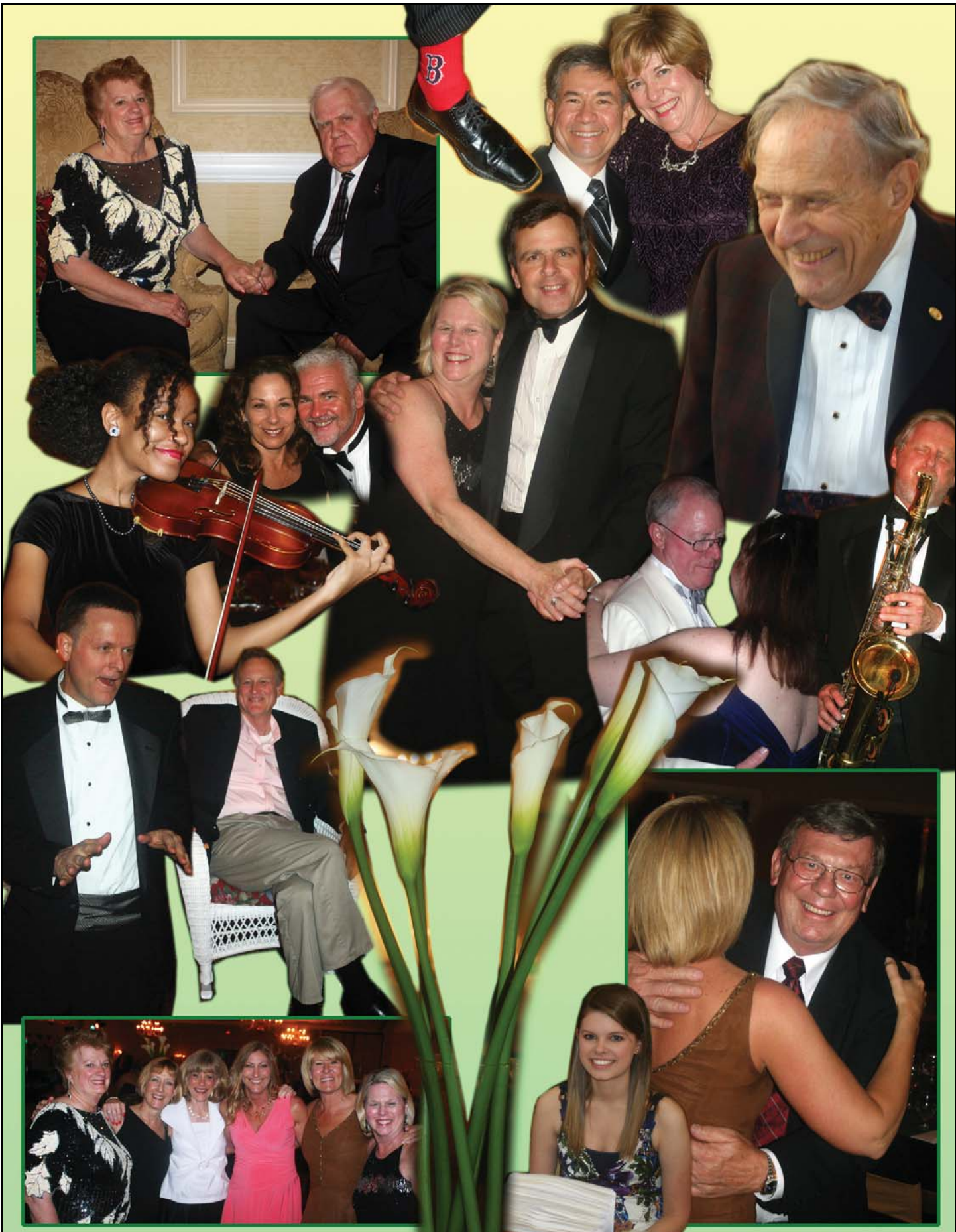
2010 Charity Ball