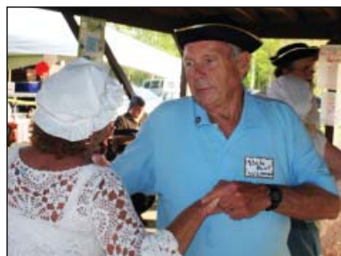
Remember our 50th year party?

First Colony is a neighborhood that is located off of Rte. 5 (John Tyler Hwy). We had our 50th anniversary picnic there a couple of years ago. I will e-mail a Mapquest this week. We will be having barbeque with all of the "fixins" and salad with assorted desserts.