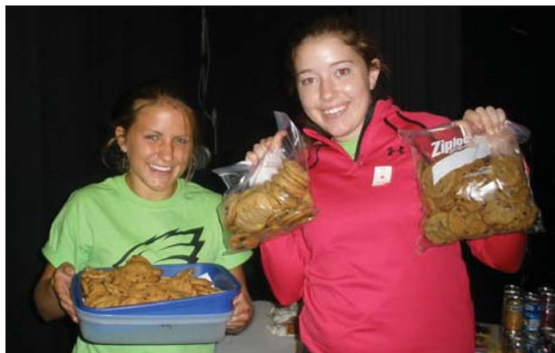
JHS Key Club members baked 10 dozen cookies!

All the clubs are aggressively recruiting new members. The numbers are rising rapidly. CKI is trying to reach 62 members as a goal, one more than it had last year. JHS Key Club will have to work to reach 400, which they reached this past spring.